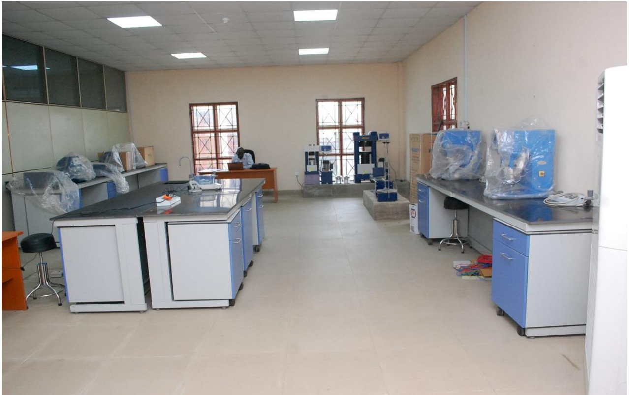
CEMENT LABORATORY - SON