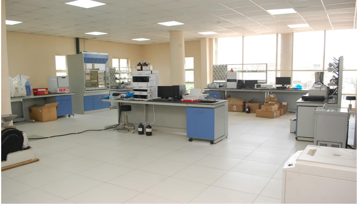
MICRONUTRIENT LAB - SON