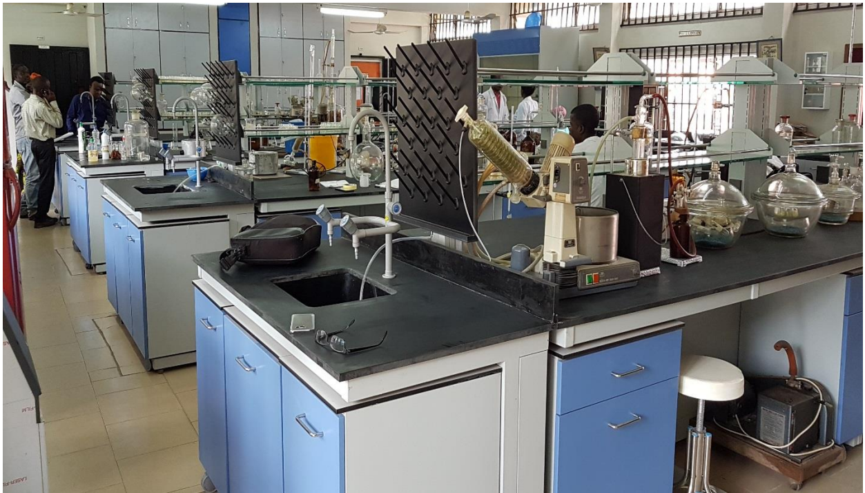
CHEMISTRY LAB - UI