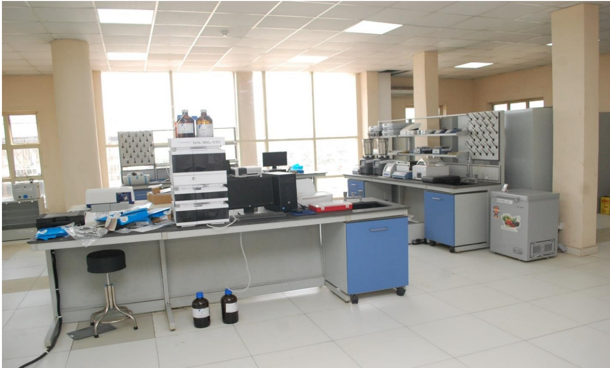
COSMETICS, WATER BENZENE AND TOBACO TESTING LAB - SON