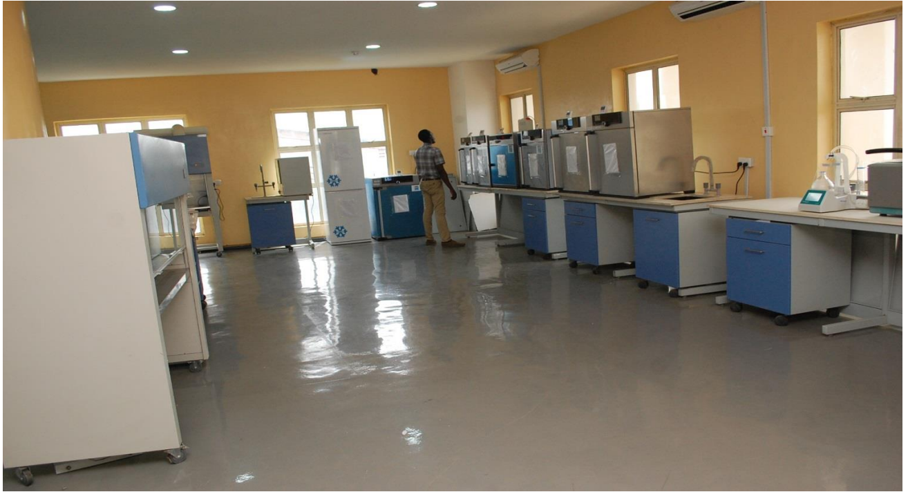
MICROBIOLOGY LAB - SON